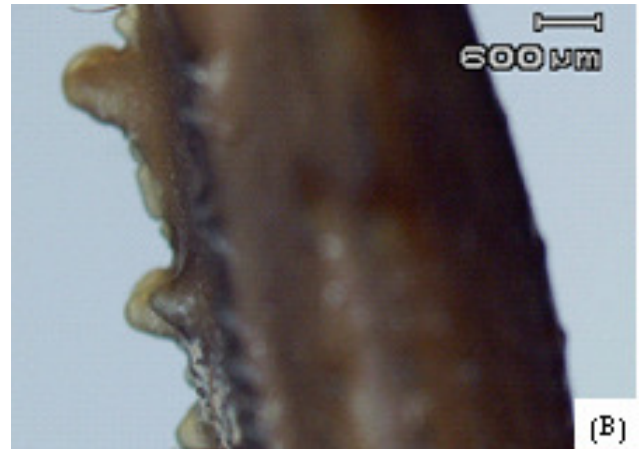
Fig 3: (A) Schematic of Androctonus doriae , (B) Dorsal digit Dentated like saw(3).