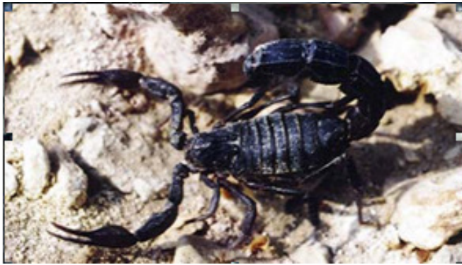
Fig.1: Androctonus crassicauda , venom is complex mixtures of neurotoxins and therefore should be handled with care.