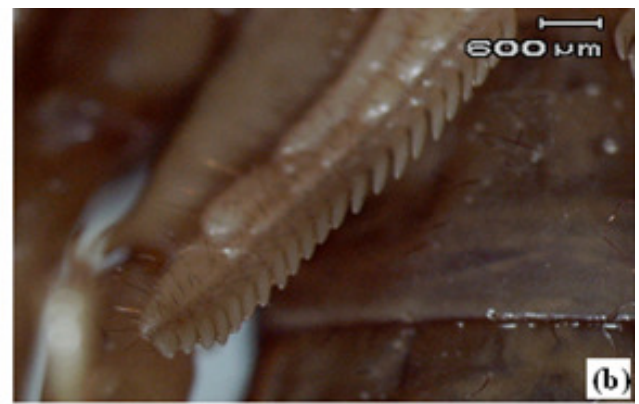
Fig. 4 : (a) Schematic of Androctonus crassicauda , (b) Dorsal view like comb (3).