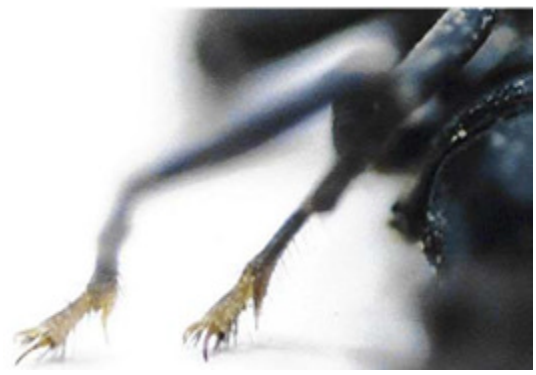
Fig. 2: The surfaces of the legs and body are covered with thicker hairs that are sensitive to direct touch.